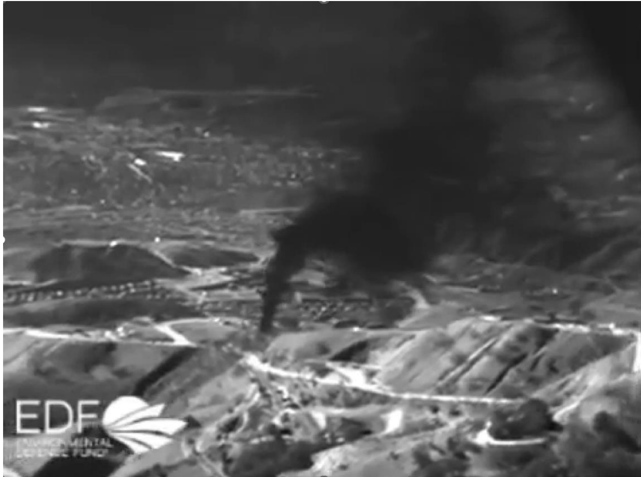
Environmental Defense Fund