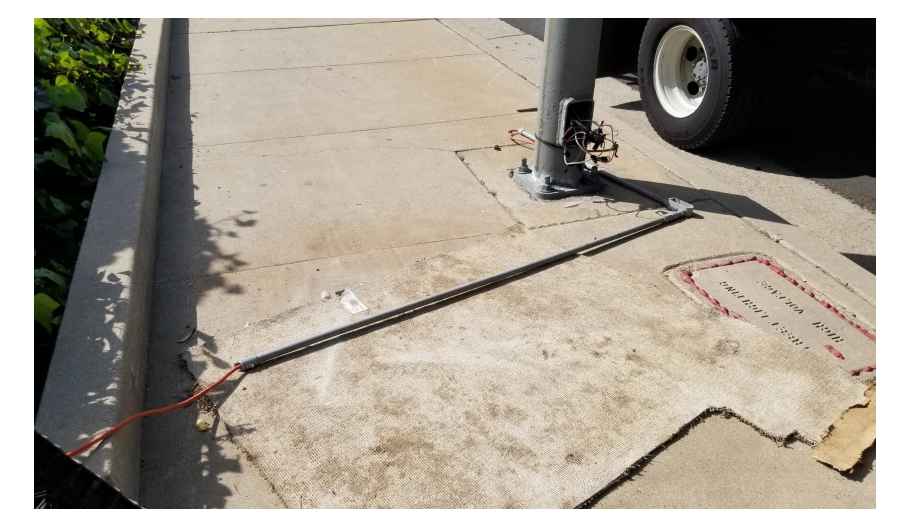
Examples of Power Theft