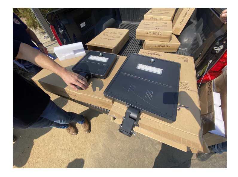
Cuesta Sol All-in-One Light (Model #2731)