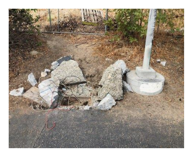
Examples of Wire Theft