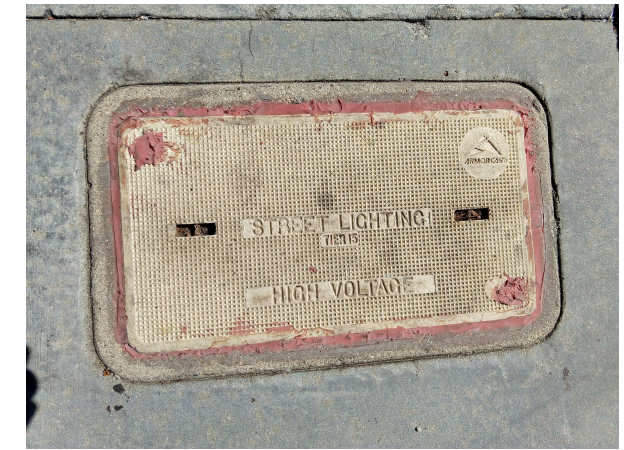
Seal Handholes and Pullboxes with Epoxy