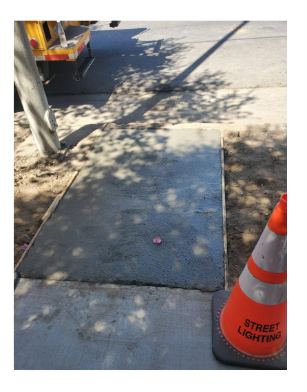
Pullbox buried under concrete (from curb to sidewalk)