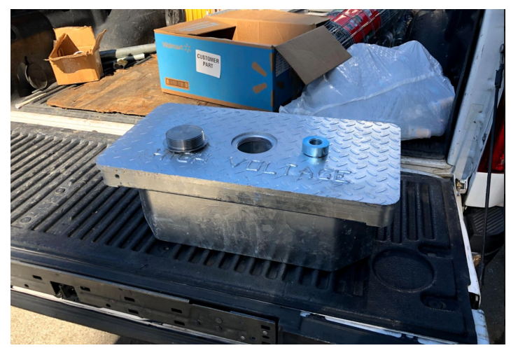
Steel Lid Components