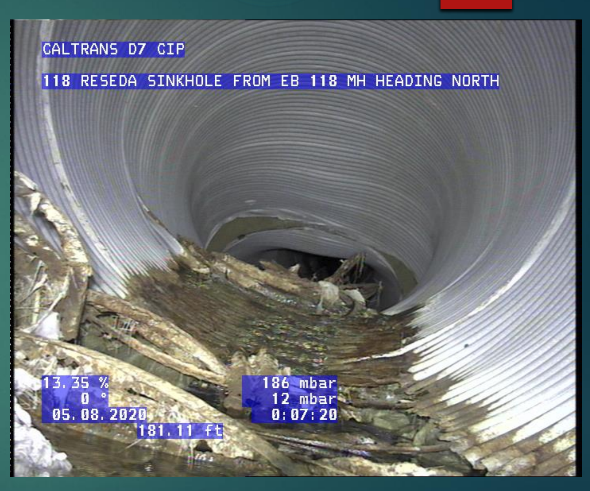
Collapsed drainage pipe under Lanes #2 & #3 of the Reseda Off-ramp