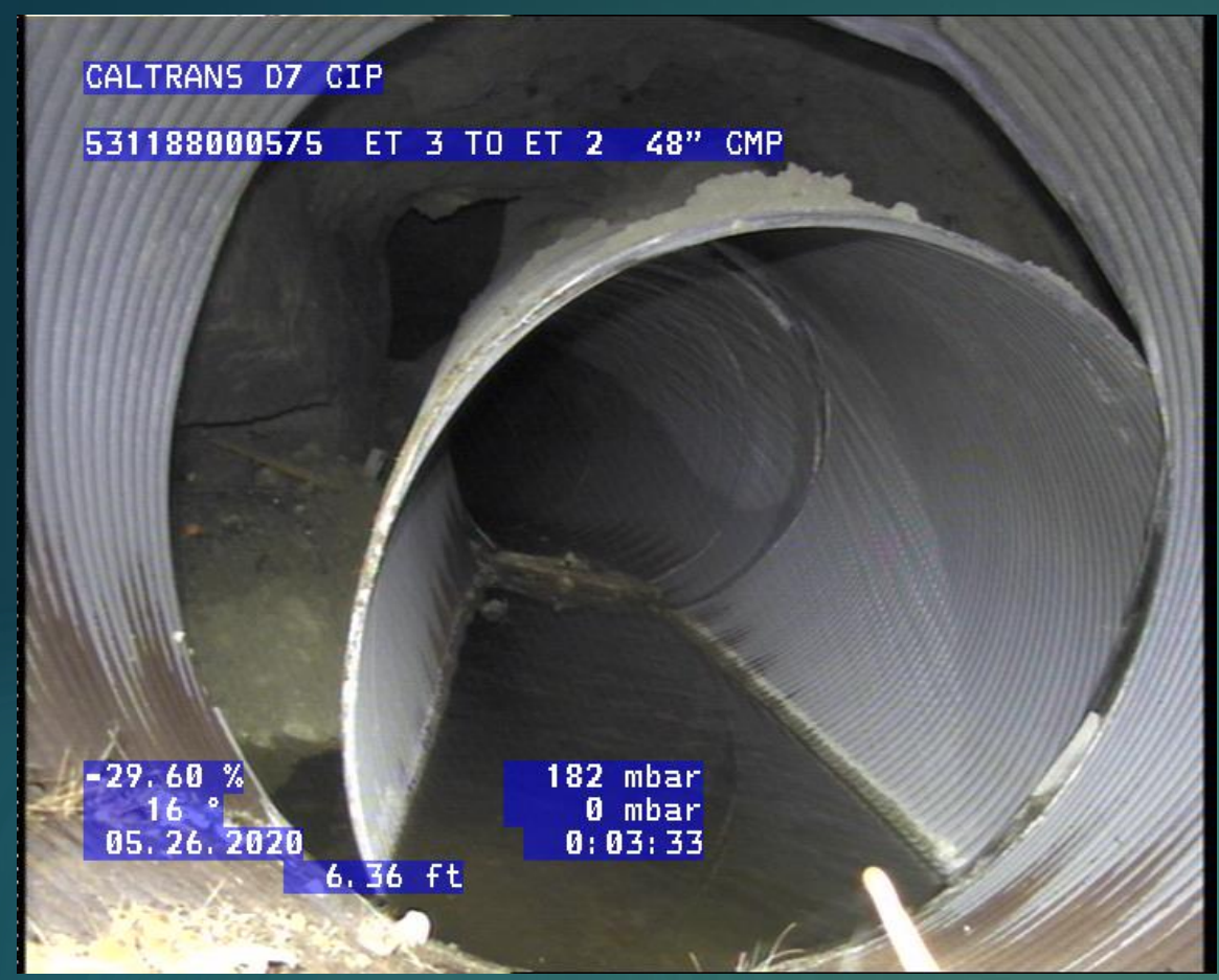
Broken connection at the Storm Drain Manhole on Rinaldi Street