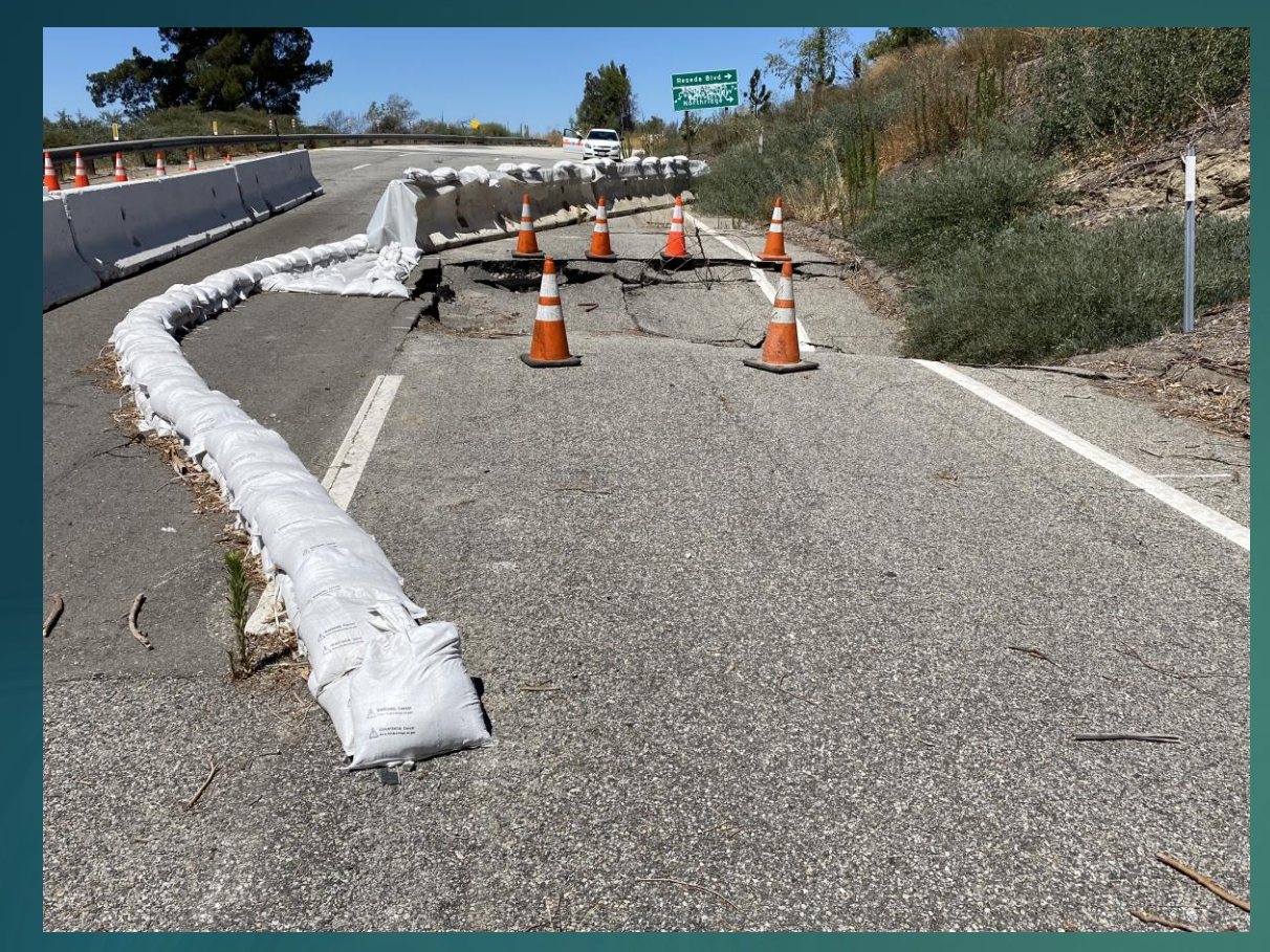
Sandbags to prevent storm runoff from entering the failed AC pavement