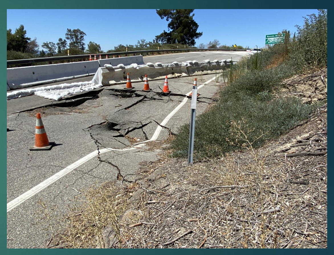
Pavement cracks 7 separation on lane #3 of Reseda Off-ramp