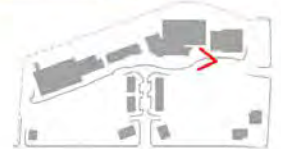
VIEW OF TERRACES FROM CINEMA PLAZA