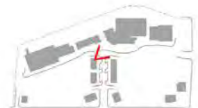
VIEW OF TOWN GREEN AND SURROUNDING RETAIL