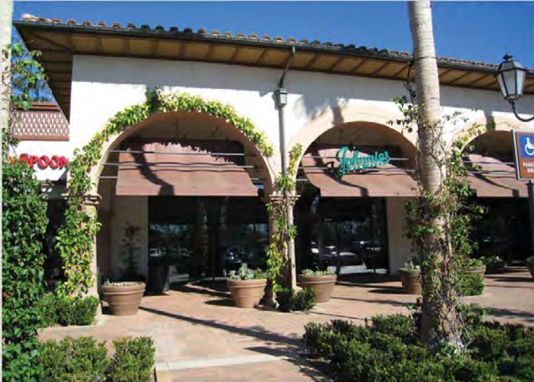
A Local and Regional Destination