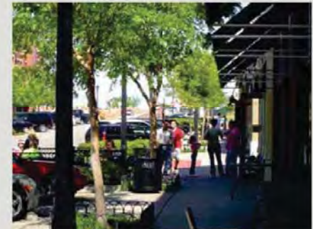
Vibrant Public Spaces