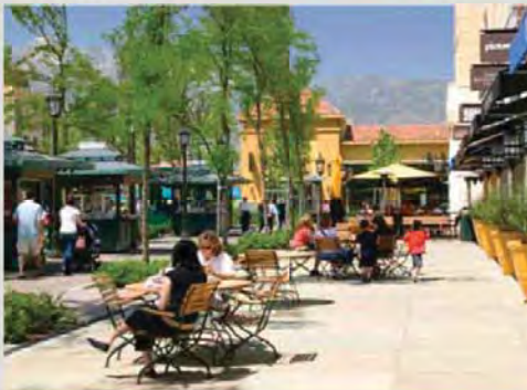
A Heightened Sense of Community